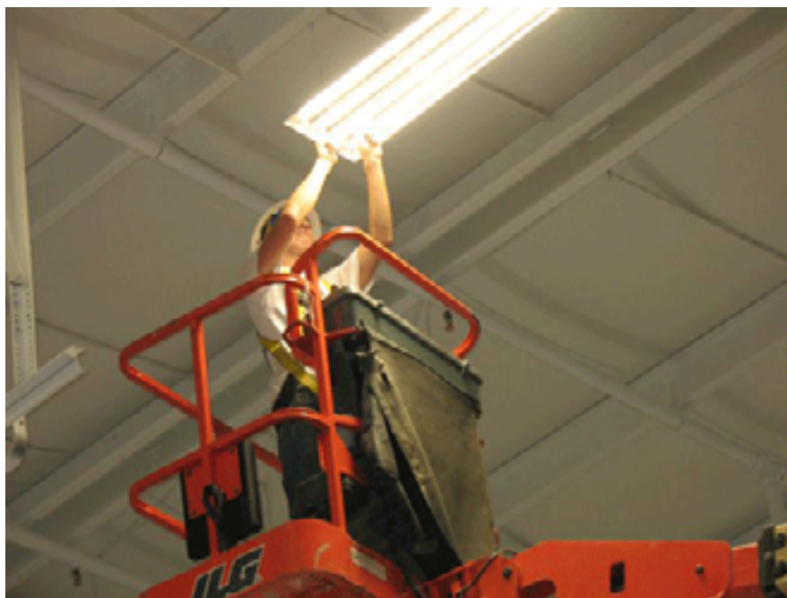
Montaplast North America, Inc. is replacing almost 1,200 halide lights with high-efficiency fluorescent fixtures at its Frankfort, Ky., facility. | Photo courtesy Montaplast

Energy Empowers is a U.S. Department of Energy clean energy information service. Our team produces stories featuring the people and businesses that are fueling the energy transformation and economic recovery in America. For more stories from your state, go to energyempowers.gov/Kentucky