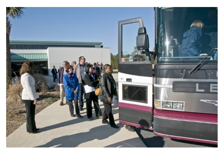
Savannah River Site tour attendees board the bus for their three-hour tour.

During March 2009, the Savannah River Site opened its gates to the general public for threehour tours departing from the Aiken County Center for Hydrogen Research campus near the site. Like numerous DOE sites, Savannah River has long had mission-related tours for visiting DOE officials, members of Congress and local state and government members, and others having official business on the