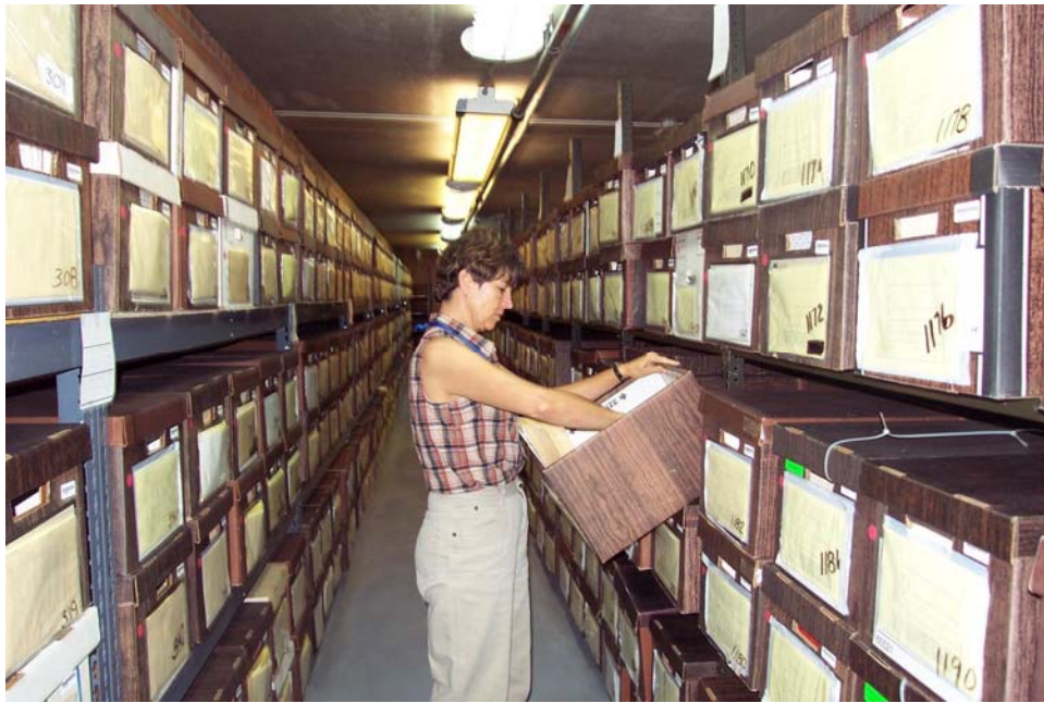
Fig.. 2. Active records storage at the DOE-LM office in Grand Junction, Colorado, provides access to information used by technical staff at that location.

Records generated through ongoing DOE-LM FUSRAP activities are managed according to LM procedures (Fig. 2). Information is needed by staff at various locations. Paper records are not suitable for organizations such as LM, which is distributed over a wide geographic area. Currently, FUSRAP records are available through the LM records management system. Pertinent documents are scanned and managed using this system, which allows access to document images at any LM location.