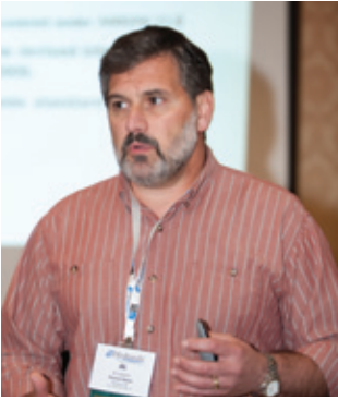
HI members share knowledge