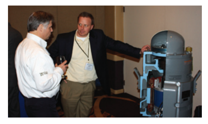
Tabletop displays add business networking value for associates