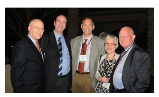
HI and Europump delegates at the Annual Meeting