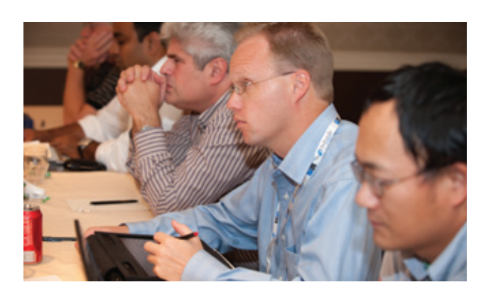
Members collaborate on standards development

for rotary pumps, vertically suspended pumps, and slurry pumps. Members received free access to the newly-launched EDE users' portal, called the HI-EDE Resource Center, throughout 2011. Those who register for the HI-EDE Resource Center are able to access the EDE Standard (HI-50.7-2010) , the HI-EDE Data Dictionary , and the Conformity Assessment Tool that allows individuals to view, edit, and create standard or custom datasheets. The contents of the datasheets can be shared with other applications as an XML file by using HI Electronic Data Exchange (HI-EDE). More information is available at www.Pumps.org/EDE.