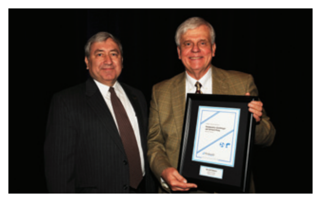
Standards contributors are recognized at the Annual Meeting

The Standards VIP recognition program was successfully launched at the 2011 Annual Meeting. The Institute is fortunate to have many engineering professionals willing to contribute their time and effort in the collaborative process of creating neutral standards, guidelines, and educational webinars for the pump community. Since the inception of the VIP program, members have been observed wearing their VIP pins during the HI meetings. Sixty-four individuals were recognized.