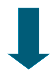
Figure 2: Initial Criteria Used to Evaluate Reservoir Fields