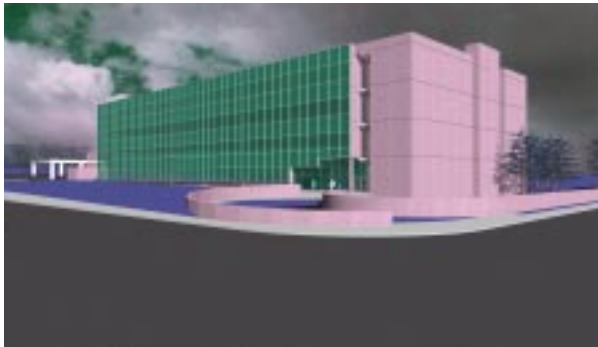
Figure 2.1.1-1. Conceptual Design of the NISC

The NISC would be a structural steel framed four-story, plus basement, building (Figure 2.1.1-1), with a design life of about 30 years. The facility would have a maximum floor space of 163,375 ft 2 (15,178 m 2 ) and an office and laboratory capacity for 465 people. Laboratories would be located in the basement. The facility would include a machine shop for fabrication of parts for satellites and experiments and high bay area at grade level connected to the side of the four-story section. The high bay area would be used to assemble and disassemble various types of equipment, such as satellite related sensors. It would contain a 10-ton bridge crane to accommodate the loading and unloading of heavy equipment and instrumentation. This bridge crane would be able to operate on the loading