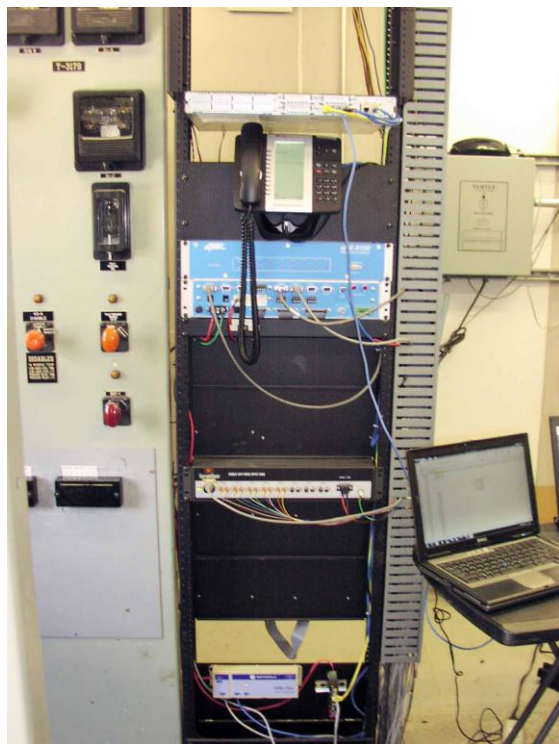
Figure 3: Decker Substation 5 with SGIG Router (above telephone) - QEI RTU (blue)

The enhanced communication functions particularly benefits coal mining companies in PRECorp's region as they require highly reliable power for their activities. To provide service to these electricity-intense industrial customers, PRECorp has increased its service delivery through automating outage detection capabilities funded by the SGIG project. The outage detection mechanisms provide shorter outage times during inclement weather, quicker fault isolation, and the ability to identify and correct situations and maintain power quality to these important companies. PRECorp's SCADA system solution provides these results through deployment of a Master Station and Remote Terminal Units (RTU) at substations.