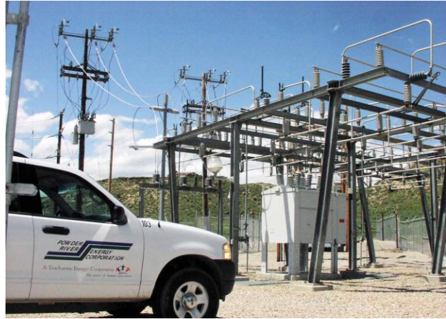
Figure 1: A Remote Powder River Substation

The addition of a communications network to PRECorp’s substations improves the overall communications and operations within the PRECorp transmission and distribution grid infrastructure. PRECorp’s biggest hurdle in delivering this backbone has been the “last mile” communications (power poles, antennas, and radios) needed to make SCADA systems fully functional. As depicted in Figure 2, information obtained via the substation last mile technology is transmitted wirelessly to the microwave backhaul then to the SCADA Master Station. Control back to the substation from SCADA also uses the microwave backhaul to communicate directly into the substation.