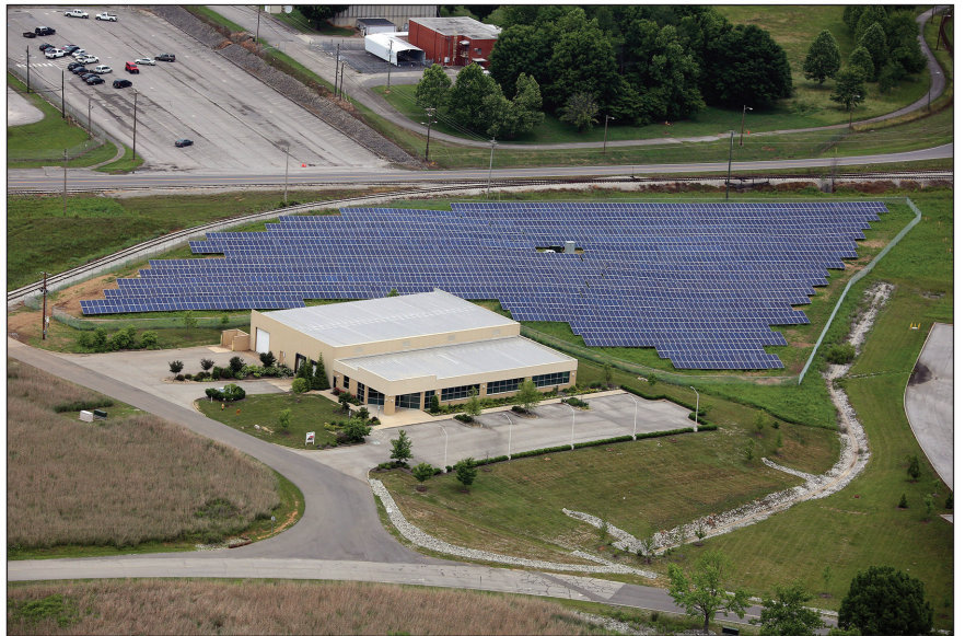
The Powerhouse Six solar array began operating at ETTP in 2015. It is a 1 megawatt power-generating facility located on a five-acre parcel and generates around 1.4 million kWh annually.

All of these properties are on former DOE land that was transferred to the Community Reuse Organization of East Tennessee (CROET). CROET has also purchased and renovated several buildings on site that have since been sold or leased to private entities. CROET reinvests proceeds from the sales to further advance the viability of ETTP as a private industrial park. When buildings at ETTP are demolished or transferred, many more private construction projects will take place as Reindustrialization continues.