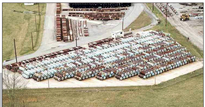
One of ETTP's cylinder yards before and after cylinder removal