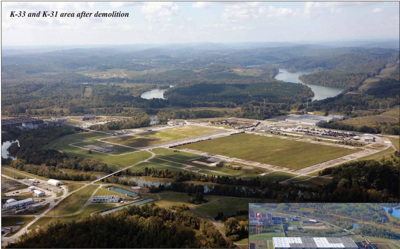
K-33 and K-31 area after demolition

as the Main Plant D&D project. The facilities include the K-1045-A Waste Oil Burning Pit, K-1408 Tire and Battery Shop, K-1300 Stack, K-1301 Fluorine Production Facility, K-1302 Fluorine Storage Building, K-1303 Fluorine Facility, K-1404 Acid Storage, K-1405 High Temperature Laboratory, K-1407 Laboratory and Storage Facility, and K-1413 Engineering Laboratory. Demolition was completed in January 2003.