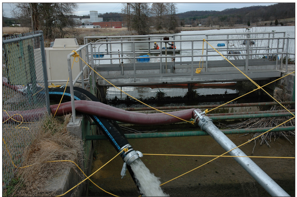
One of the contaminated ponds at ETTP being drained

Remediation of the ETTP 1007-P1 and 901-A Ponds and 720 Slough was completed using ecological enhancement. Ecological enhancement is an innovative approach to remediation that includes fish community restructuring, revegetation, and wildlife management. The goal is to establish a new condition within the ponds that reduces risk from polychlorinated biphenyls (PCBs) by enhancing components of the ecology that minimize PCB uptake. Actions completed were removing fish that bioaccumulate PCBs, restocking with fish (bluegill) that do not bioaccumulate PCBs, planting aquatic vegetation to limit