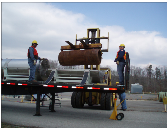
UF_6 cylinder being loaded for transport at ETTP

Following removal of the scrap material, remediation of contaminated soils was initiated in 2009. Radiological walkover surveys and soil sampling were used to define excavation areas. Approximately 67,000 yd 3 of contaminated soil and debris were excavated and transported to EMWFM for disposal between May 2009 and October 2010, including more than 11,000 yd 3 of asbestos-contaminated soil and debris. Approximately 500 yd 3 of more highly contaminated soil and debris were shipped for disposal at the Nevada National Security Site and the Energy Solutions facility in Clive, Utah.