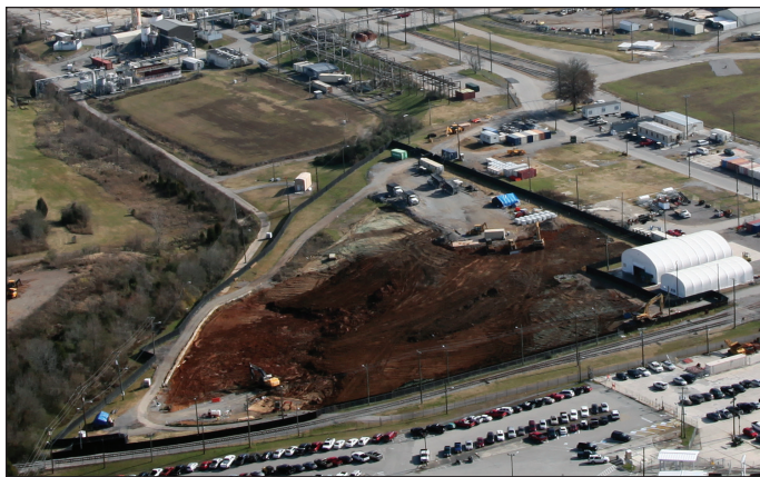
K-1070-B during remediation

Personnel cleaning up the burial ground worked 205,800 accident-free hours while excavating 100,200 cubic yards of soil and debris. A total of 7,790 dump truck loads of waste shipped to EMWMF.