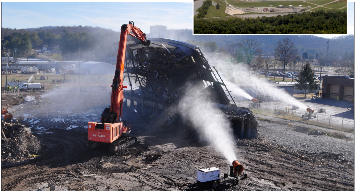
The final section of the K-25 Building was demolished in December 2013.