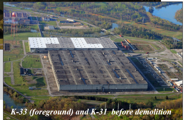
K-33 (foreground) and K-31 before demolition

Bechtel Jacobs Company LLC completed demolition of K-29