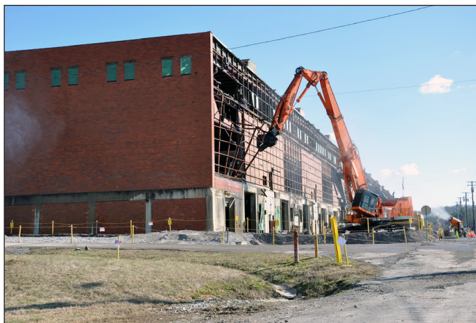
K-27 demolition kicked off in early 2016.

Major facilities that have been successfully demolished include the K-1004-A, B, C, and D Laboratories, K-1004-L, K-1008/K-1020 areas, K-1501 steam plant, K-1420, K-29,