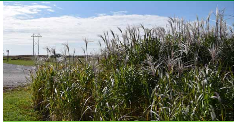
Miscanthus can be grown on degraded land and has favorable GHG reductions as a biofuel feedstock.

Growing biomass for bioenergy can either improve or reduce the diversity of plant and wildlife populations, depending on where it is grown, the existing land cover, and the way the land