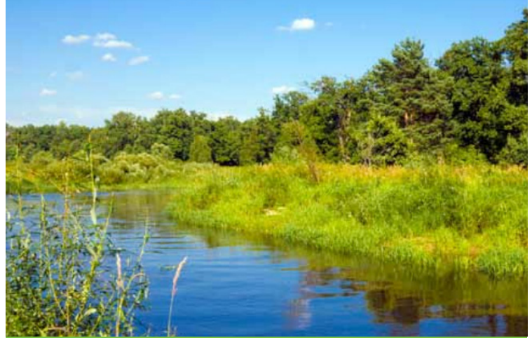
BETO’s sustainability work includes assessing water resource use and water quality impacts of bioenergy production.

The existing and emerging biofuels industry will need to develop systems that not only meet economic and market needs, but also address environmental and social aspects such as resource availability and public acceptance. To that end, BETO supports