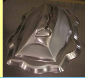
Schematic of possible forming tool positions (left) and a sample part formed at Ford (right).

as well as detailed features. The tools have multiple degrees of freedom, and can be independently controlled or synchronized to achieve desired shapes.