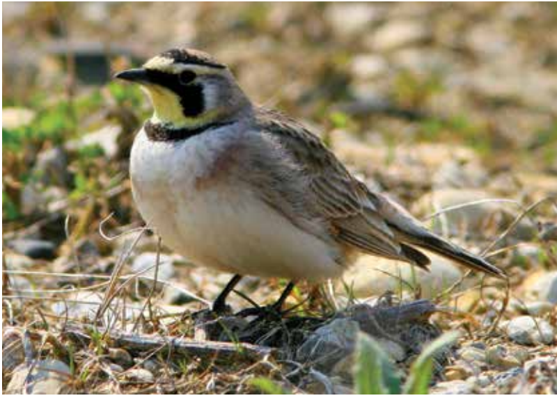
HORNED LARK

Bats are long-lived and some species have low reproductive