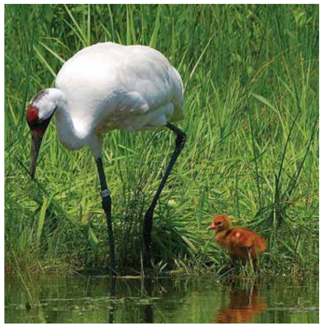
WHOOPING CRANES

Mitigation methods based on avian vision have been proposed to reduce bird collisions with wind turbines. It has been hypothesized that towers and blades coated with ultraviolet (UV) paint may be more visible to birds, making them easier to avoid. In the only known test, Young et al. (2003) compared fatality rates at turbines with UV coatings to turbines coated with standard paint and found no differ-