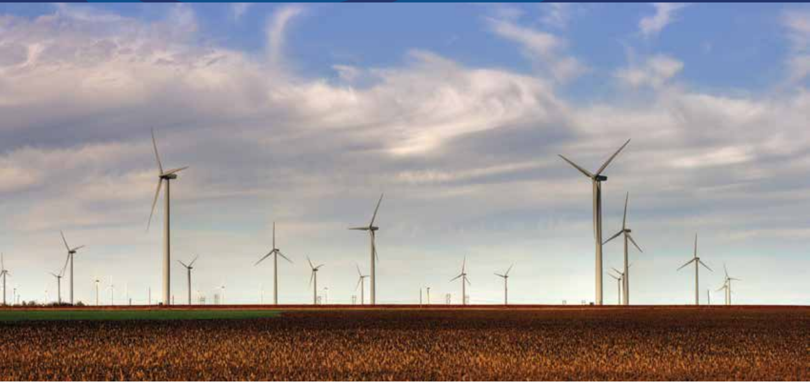
SMOKY HILLS WIND FARM

Wind Turbine Interactions with Wildlife and their Habitats: A Summary of Research Results and Priority Questions