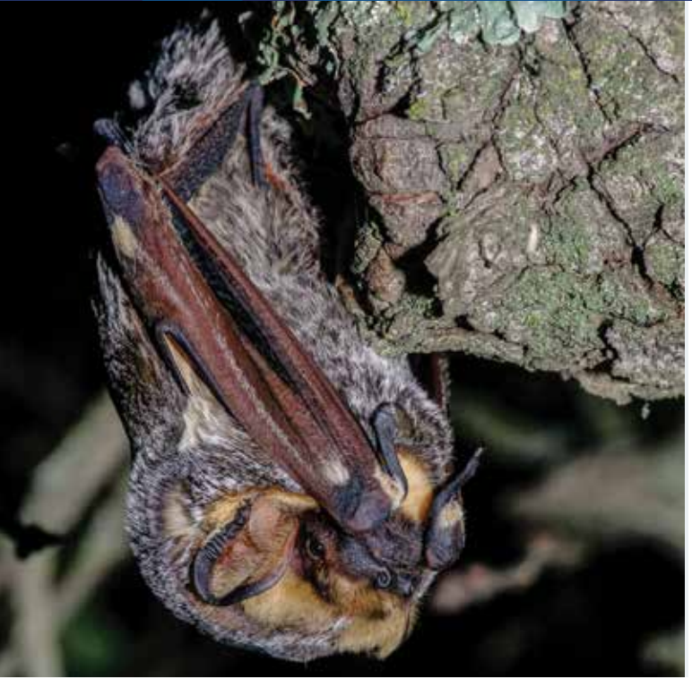
HOARY BAT, PHOTO BY DANIEL NEAL, FLICKR