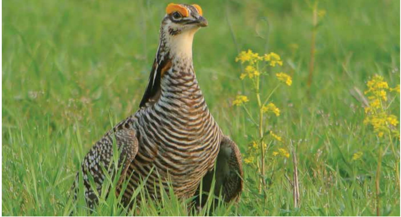
GREATER PRAIRIE-CHICKEN

Wind Turbine Interactions with Wildlife and their Habitats: A Summary of Research Results and Priority Questions DIRECT AND INDIRECT HABITAT-BASED EFFECTS OF WIND ENERGY DEVELOPMENT ON BIRDS (CONTINUED)