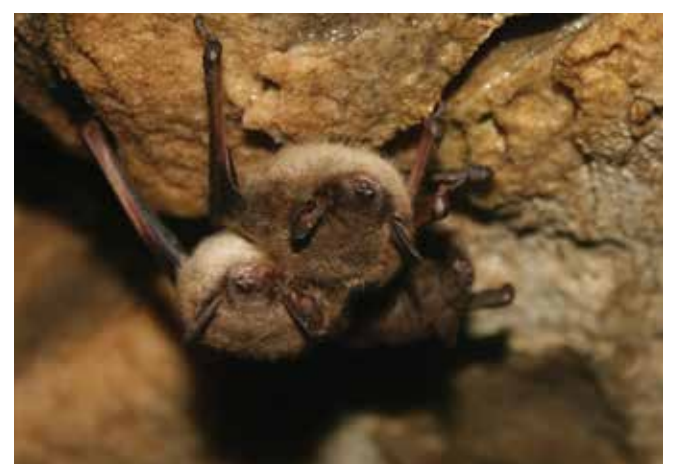
LITTLE BROWN BATS