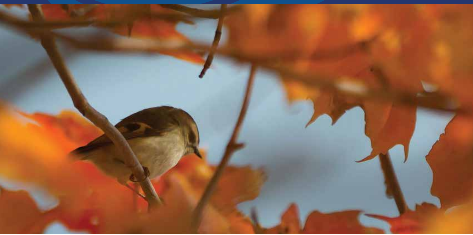
GOLDEN-CROWNED KINGLET

Wind Turbine Interactions with Wildlife and their Habitats: A Summary of Research Results and Priority Questions