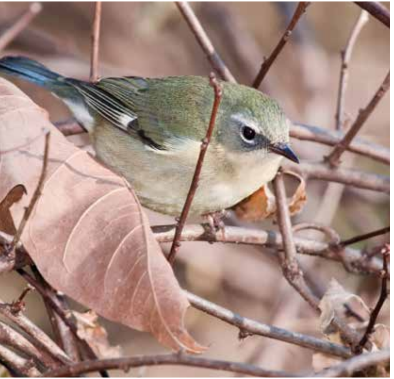
BLACK THROATED BLUE WARBLER

This first section briefly outlines what is known and where there is remaining uncertainty about the patterns of collision fatalities focusing in the continental U.S. We first examine patterns that apply to both birds and bats and then describe patterns for birds and bats separately.