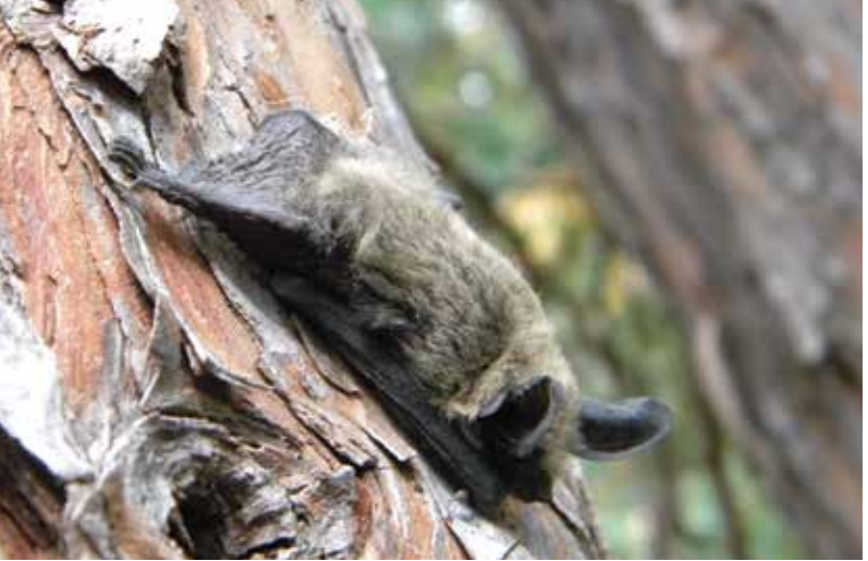
SILVER-HAIRED BAT

Wind Turbine Interactions with Wildlife and their Habitats: A Summary of Research Results and Priority Questions AVOIDING AND MINIMALIZING BIRD AND BAT FATALITIES (CONTINUED)