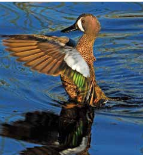
BLUE-WINGED TEAL

tions," was first produced by the Wildlife Workgroup of the National Wind Coordinating Collaborative (NWCC) in 2004 and then updated in 2010. In January 2012 the American Wind Wildlife Institute began facilitating the NWCC, and this updated fact sheet continues the tradition of previous fact sheets in reflecting the latest assessment of wind energy impacts on wildlife based on a review of the available literature.