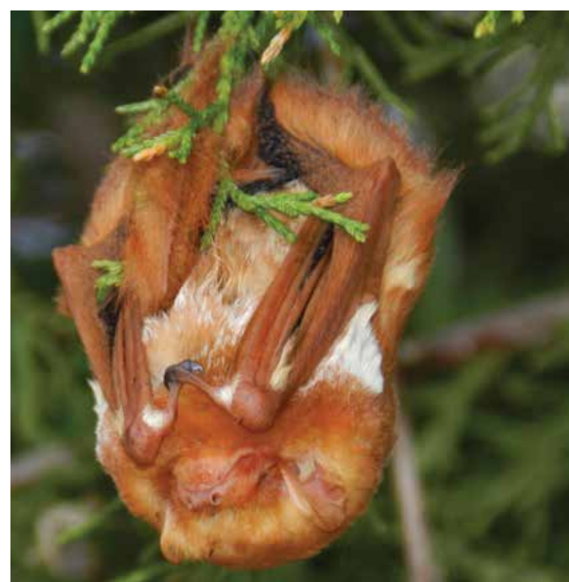
EASTERN RED BAT

behavior (Kunz et al. 2007a; Cryan 2008; Cryan and Barclay 2009). Analysis of bat carcasses beneath turbines found large percentages of mating readiness in male hoary, eastern red and silver-haired bats, indicating that sexual readiness coincides with the period of high levels of fatalities in these species (Cryan et al. 2012).