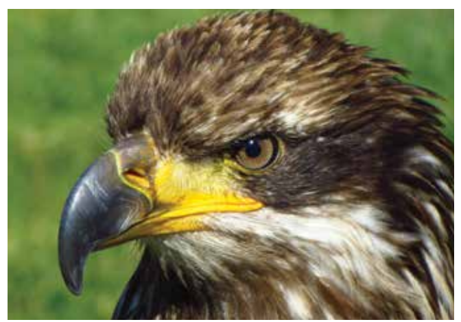
GOLDEN EAGLE

Numbers of raptor fatalities appear to be declining as a result of the repowering at Altamont; smaller low-capacity turbines are being replaced with taller, higher-capacity turbines (Smallwood and Karas 2009). Larger turbines have fewer rotations per minute, and this difference may be partly responsible for the lower raptor collision rates (NAS 2007). In addition, smaller turbines that use lattice support towers offer many more perching sites for raptors than large, modern turbines