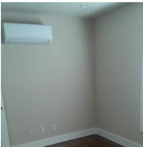
A high-performance ductless heat pump provides all of the home's heating and cooling.