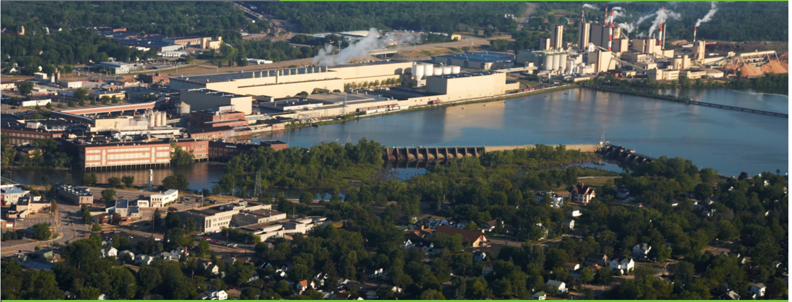
Recovery Act funds helped NewPage Wisconsin System Inc. install new high-efficiency paper machine cleaners at its mill in Wisconsin Rapids, Wisconsin.