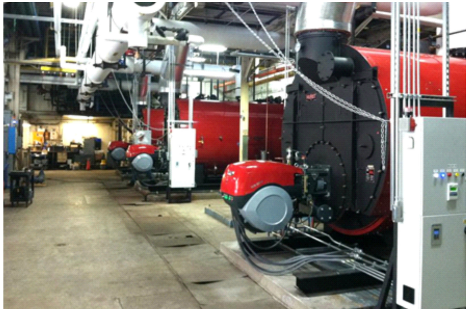
Briggs and Stratton Corporation replaced high-pressure steam boilers with a combination of more efficient low-pressure steam boilers and hot water boilers at its engine manufacturing facility in Wauwatosa, Wisconsin.