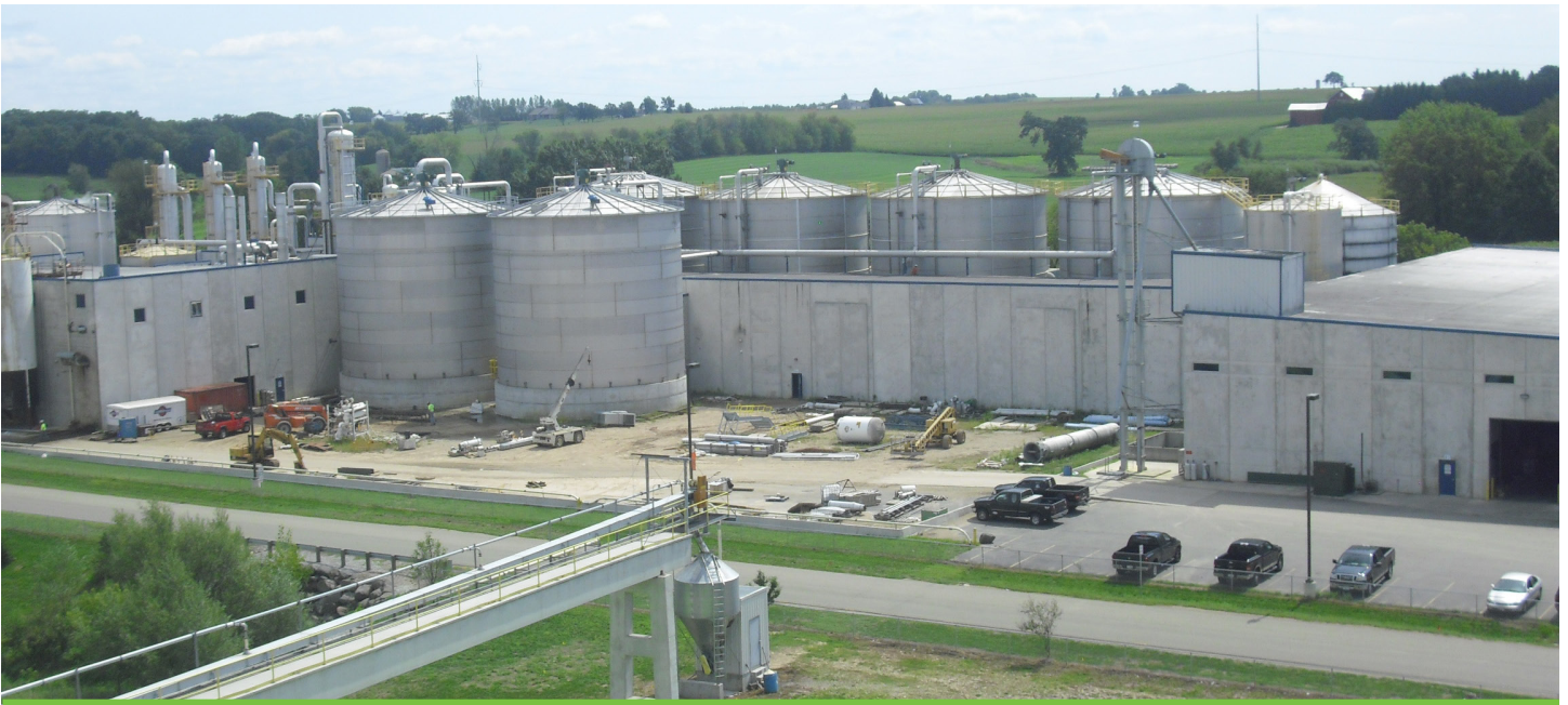
Didion Milling, Incorporated improved the ethanol production process, including optimized drying and moisture removal, at its ethanol refinery in Cambria, Wisconsin.