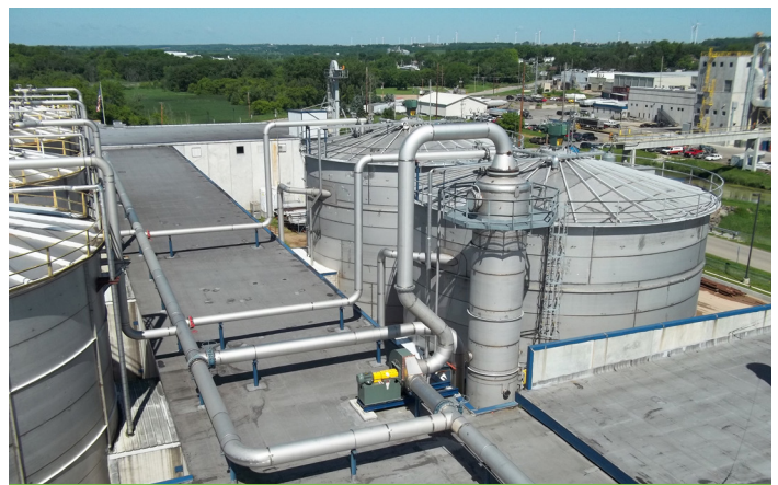
Didion Milling, Incorporated's new fermentation tanks and CO 2 scrubber vessel are in full operation at its ethanol refinery in Cambria, Wisconsin.