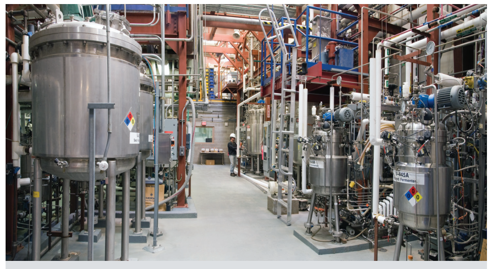
Researchers at NREL's Integrated Biorefinery Research Facility study biochemical processes for the conversion of lignocellulosic biomass. NREL can process biomass at a scale of 1 ton per day.