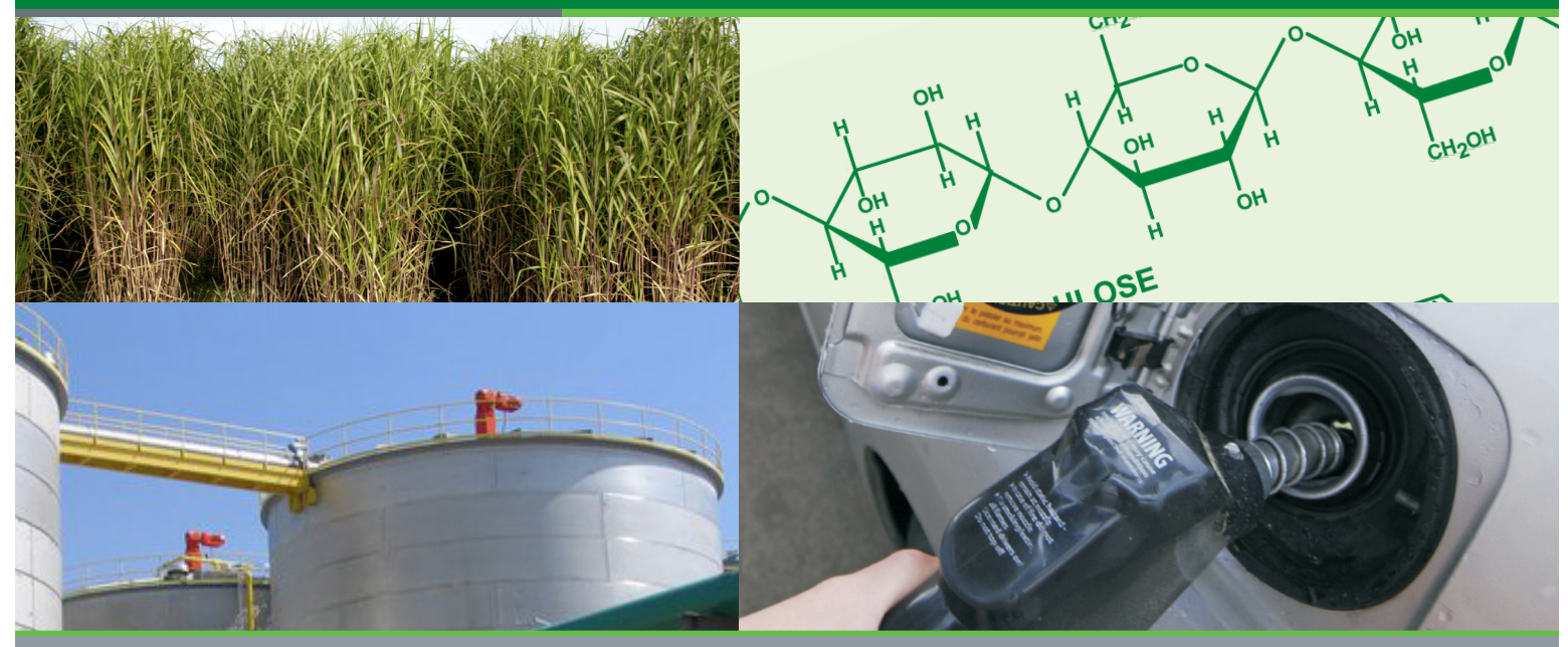
New pathways will enable energy-efficient biochemical conversion of lignocellulosic biomass into biofuels that are compatible with today's vehicles and infrastructure.