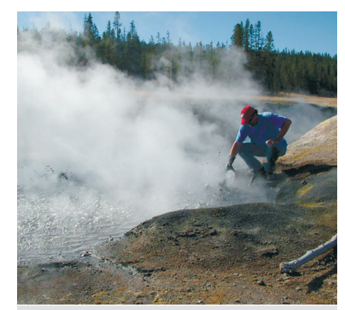
Scientist bioprospecting for microbes at Yellowstone National Park.