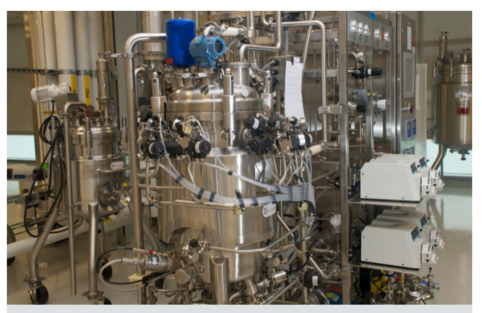
The Advanced Biofuels Process Demonstration Unit at LBNL can convert biomass into advanced biofuels in sufficient quantities for engine testing.