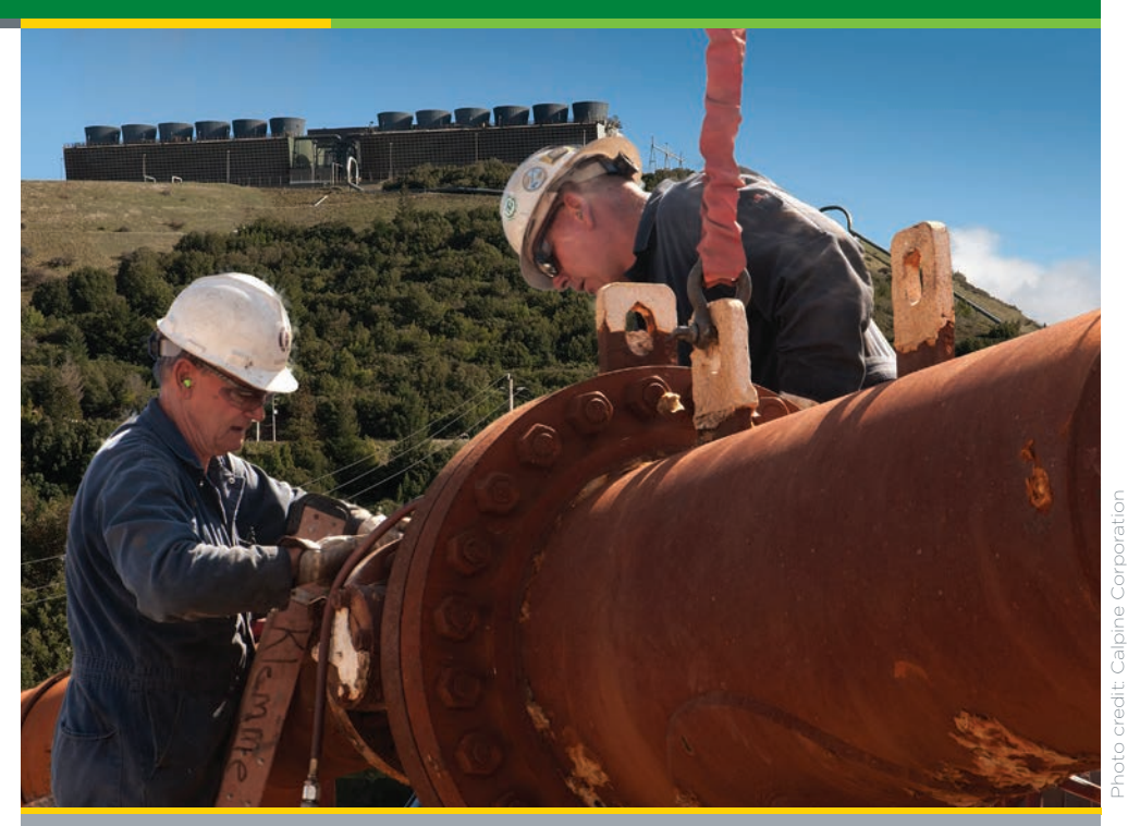
The Geysers field in northern California boasts the largest geothermal complex in the world and the first successful demonstration of EGS technologies in the United States.

Visit the GTO website at geothermal.energy.gov for more information on EGS development, or contact geothermal@ee.doe.gov.