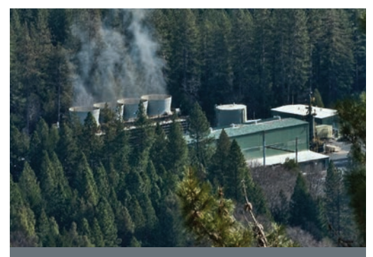
The Geysers field in northern California contains optimal conditions for validating EGS resources