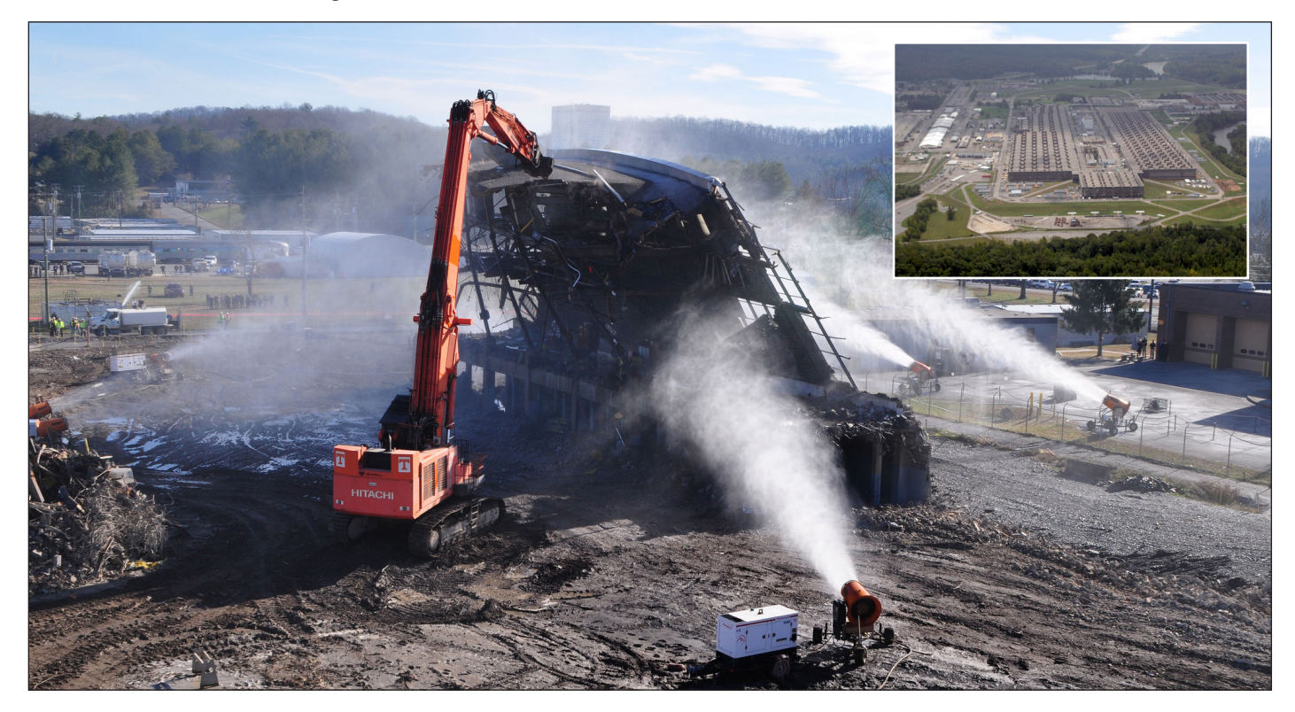
The final section of the K-25 Building was demolished in December 2013.