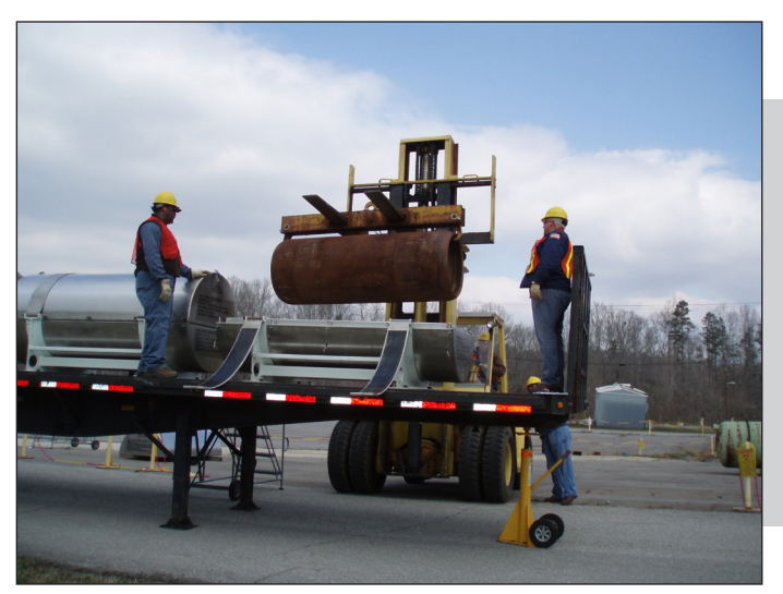
UF<sub>6</sub> cylinder being loaded for transport at ETTP

The K-770 Scrap Metal Yard covers approximately 30 acres on the east bank of the Clinch River in the Powerhouse Area. During the 1940s and 1950s, the K-770 site was used as an oil tank farm