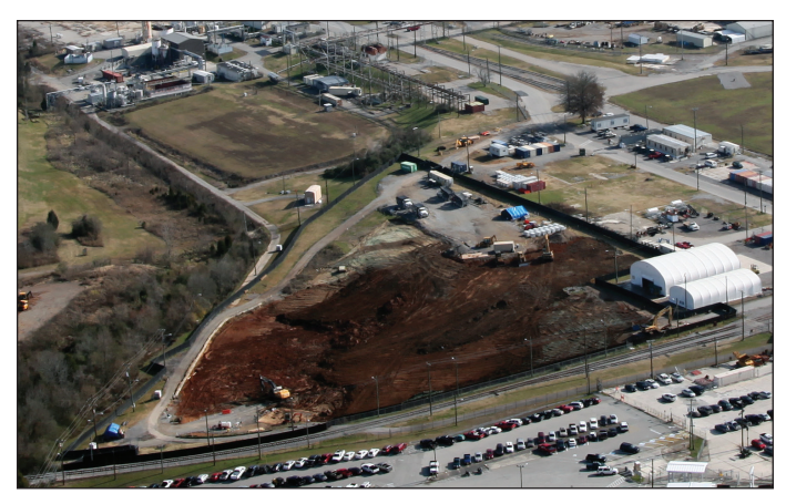
K-1070-B during remediation

Personnel cleaning up the burial ground worked 205,800 accident-free hours while excavating 100,200 cubic yards of soil and debris. A total of 7,790 dump truck loads of waste shipped to EMWMF.