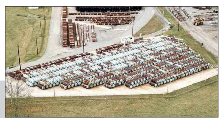
One of ETTP's cylinder yards before and after cylinder removal

Following removal of the scrap material, remediation of contaminated soils was initiated in 2009. Radiological walkover surveys and soil sampling were used to define excavation areas. Approximately 67,000 yd<sup>3</sup> of contaminated soil and debris were excavated and transported to EMWMF for disposal between May 2009 and October 2010, including more than 11,000 yd<sup>3</sup> of asbestos-contaminated soil and debris. Approximately 500 yd<sup>3</sup> of more highly contaminated soil and debris were shipped for disposal at the Nevada National Security Site and the Energy Solutions facility in Clive, UT.