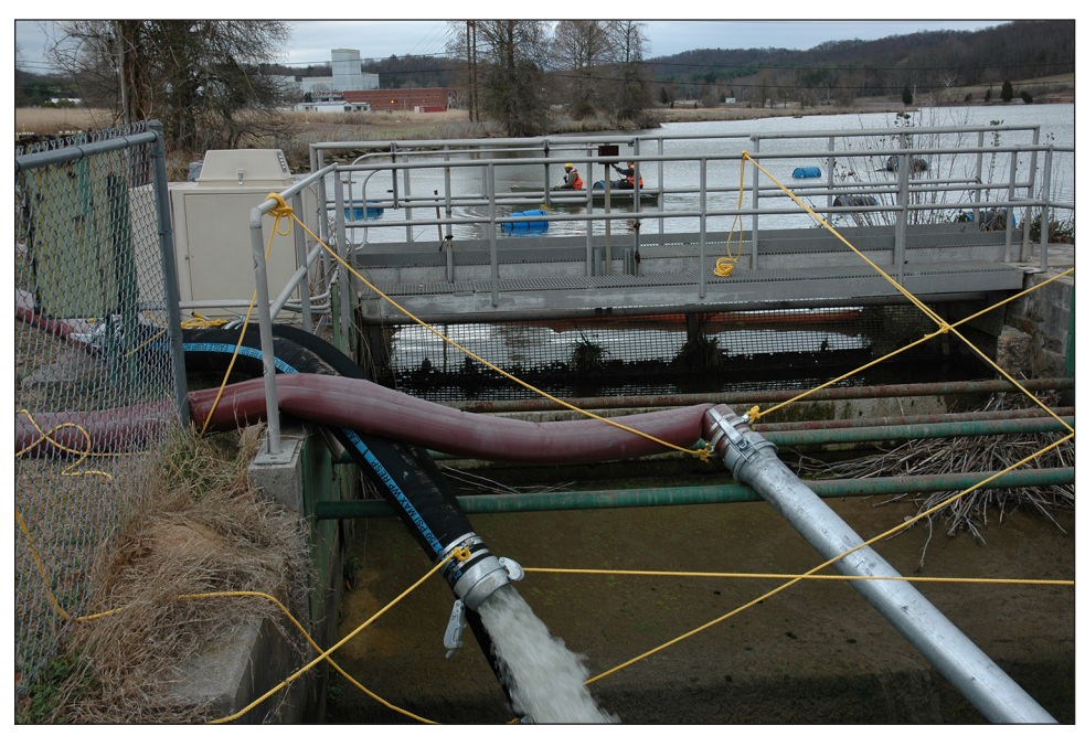
One of the contaminated ponds at ETTP being drained

Remediation of the ETTP 1007-P1 and 901-A Ponds and 720 Slough was completed using ecological enhancement. Ecological enhancement is an innovative approach to remediation that includes fish community restructuring, revegetation, and wildlife management. The goal is to establish a new condition within the ponds that reduces risk from polychlorinated biphenyls (PCBs) by enhancing components of the ecology that minimize PCB uptake. Actions completed were removing fish that bioaccumulate PCBs, restocking with fish (bluegill) that do not bioaccumulate PCBs, planting aquatic vegetation to limit sediment resuspension, and