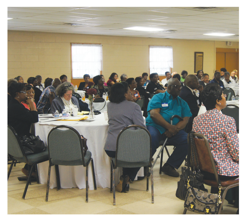
Wadmalaw Island, SC, Community Leaders Institute.

The Department's EJ program has involved community stakeholders in the decision-making process through public participation in the form of community meetings and conferences. In these meetings, DOE has provided information and opportunities for the public to participate with and assist DOE in identifying issues and problems. A significant number of programs, activities and partnerships were created and implemented during the first five years of DOE's implementation of its Strategic Goals and Work Plans. (See Appendix A.)