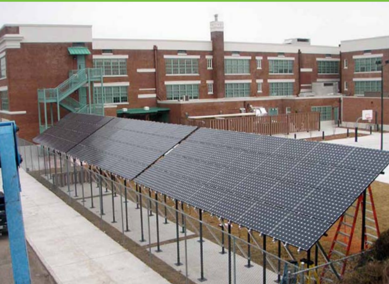
Craig Elementary School, located in New Orleans, installed one of the largest solar systems in the city.