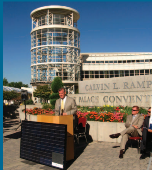
Clockwise from top left: Photovoltaic system in Philadelphia Center City district; rooftop solar electric system at sunset; Premier Homes development with building-integrated PV roofing, near Sacramento; PV on Calvin L. Rampton Salt Palace Convention Center in Salt Lake City; PV on the Denver Museum of Nature and Science; and solar parking structure system at the Cal Expo in Sacramento, California

U.S. DEPARTMENT OF ENERGY Energy Efficiency & Renewable Energy