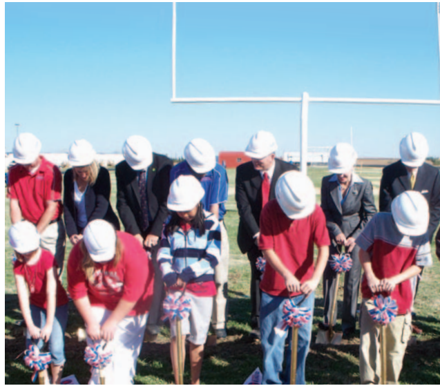
Students and community leaders broke ground on the new school in October 2008.