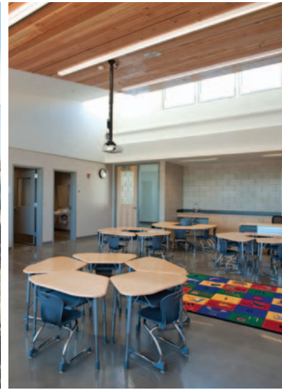
Classroom daylighting can positively impact students' health and development.

Many of the efficiency measures used in the school were based on recommendations in the Advanced Energy Design Guide for K-12 School Buildings , an energy efficiency guide developed by DOE and NREL in collaboration with national professional societies.