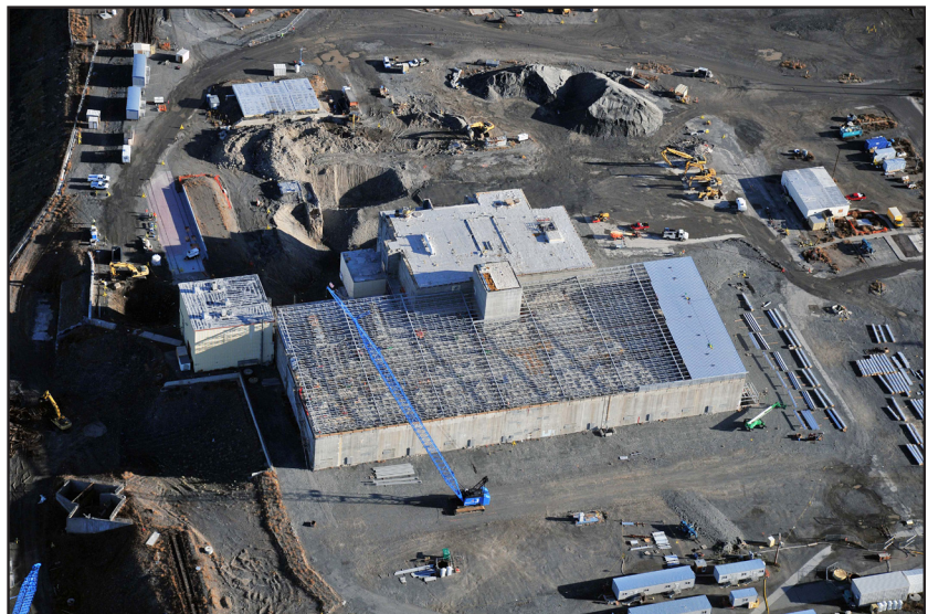
DOE Nuclear Facility Construction Project

This report begins with a high-level overview of DOE nuclear facilities and operations (Section 3). It then provides a summary of the analysis of the responses to Safety Bulletin 2011-01 for DOE's nuclear complex (Section 4); a review of DOE and commercial nuclear power industry requirements and guidance related to BDBEs (Section 5); and the results from DOE's June 2011 Nuclear Safety Workshop, which focused on BDBEs (Section 6). Based on the information from these analyses and reviews, the report then discusses the insights and opportunities for improvement (Section 7) and provides recommendations for short-term and long-term actions to improve nuclear facility safety (Section 8). Appendix A provides additional background and details on DOE's approach to nuclear safety.