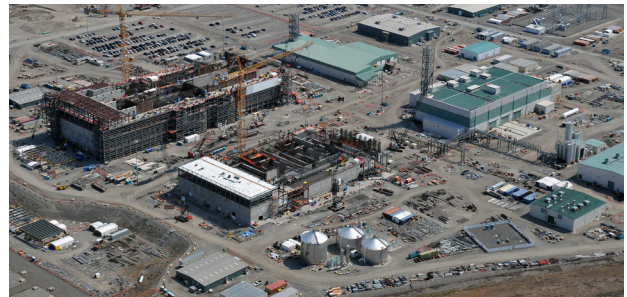
Hanford Site's Waste Treatment and Immobilization Plant

Confirm safety systems are being maintained in an operable condition in accordance with technical safety requirements.