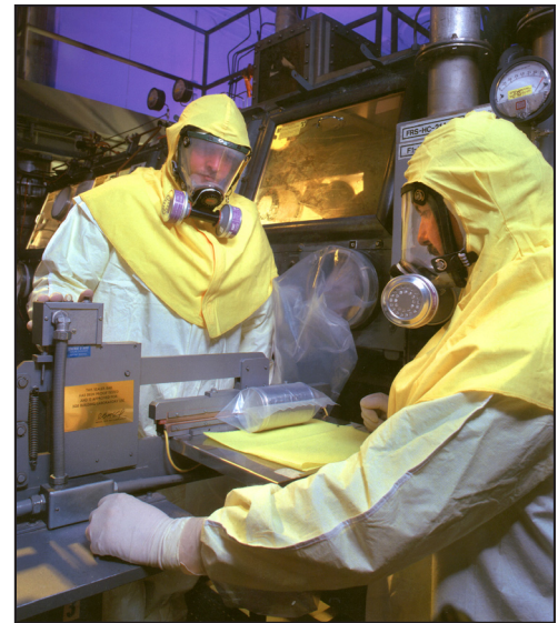
DOE Nuclear Packaging Operation

In regard to BDBEs, the safety analysis requirements in Title 10 CFR Part 830, Nuclear Safety Management , and in the safety analysis development standard used for most DOE nuclear facilities (DOE-STD-3009-94, Preparation Guide for DOE Nonreactor Nuclear Facility Documented Safety Analyses ) require that the site/facility consider the need for analysis of accidents that may be beyond the design basis of the facility in order to provide a complete perspective on the risk associated with operating the facility. DOE provides no amplifying requirements or guidance regarding how “the need for analysis of accidents” is to be considered or documented. DOE also has a safety analysis guide (DOE Guide 421.1-2, Implementation Guide for Use in Developing Documented Safety Analyses to Meet Subpart B of 10 CFR 830 ) that provides general guidance supporting the development of safety analyses, but it does not provide guidance on the analysis or consideration of BDBEs. In regards to seismic performance, DOE standards for seismic design have sufficient conservatism, in general, to achieve less than 10 percent probability of unacceptable performance for ground motion equal to 150 percent of design basis ground motion (a list of these Standards is included in Appendix A).