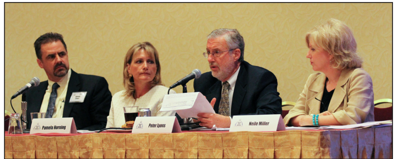
DOE Senior Management Panel

The first day of the workshop explored the accident at the Fukushima Daiichi nuclear power station in Japan and the organizational insights that DOE could gain from this tragic accident. Senior Departmental leaders shared their vision of how DOE is moving forward to improve its nuclear safety, and a panel of senior managers discussed the DOE nuclear safety culture, highlighting the importance of maintaining a strong, integrated safety management approach. The first day also included technical