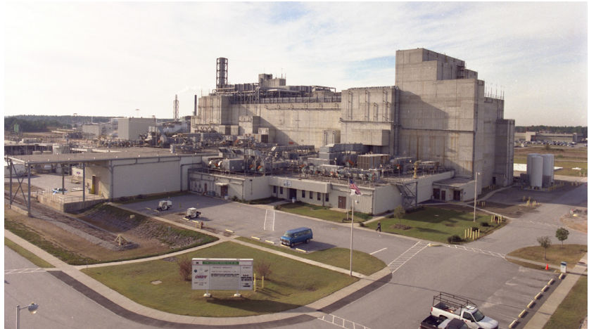
Defense Waste Processing Facility at SRS

DOE conducts three basic types of nuclear operations: nuclear weapons stockpile maintenance, research, and environmental remediation. The operations are performed in a variety of facilities, including nuclear reactors; weapons disassembly, maintenance, and testing facilities; nuclear material storage facilities; processing facilities; and waste disposal facilities. These facilities are located at national laboratories, cleanup sites, research and development sites, and manufacturing sites throughout the United States as shown in Figure 1.