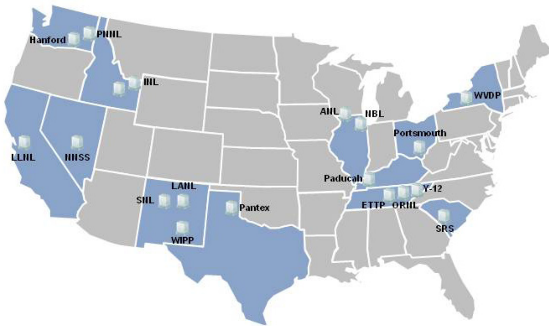
Figure 1. Locations of DOE Sites with Nuclear Facilities (See page i of this report for a list of acronyms)