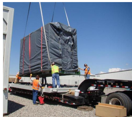
Preparing Low Level Waste for Transport

As discussed in Section 5, 10 CFR Part 830, DOE-STD-3009-94, and DOE Order 151.1C require consideration of BDBEs. However, these documents do not address the specific types of BDBEs that should be analyzed or provide detailed guidance on how the results of the analyses are to be used, as noted in Section 4. Additionally, DOE does not provide detailed expectations regarding the mitigation of severe accidents and BDBEs, differing in this way from the guidance and requirements issued by the NRC or the stress tests initiated by the EU, as discussed in Section 5. Further, the Nuclear Safety Workshop confirmed many of the items noted in the Safety Bulletin analyses discussed in Section 4 and identified additional areas where further requirements and guidance are warranted.