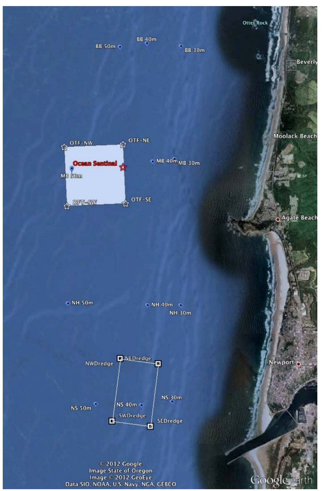
Figure 1: Map of project area. Repeat sampling locations are indicated with blue pins. The Ocean Test Facility project area is indicated by the light blue box. The planned location for the first test is indicated with the red star. US ACE dredge spoils sampling area is indicated by the white outline.