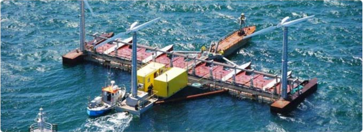
Figure 4. Poseidon 37 (Shown with Wind Turbine Configuration)

Power Plant A/S (FPP). The Poseidon 37, a 327,000-kilogram (360-ton) and 37-meters (121-foot)-wide hybrid renewable energy demonstration plant (Figure 4), was launched in 2008 off the coast of Lolland in Denmark (Floating Power Plant 2011). Although the Poseidon 37 can be configured with wind turbines, any Poseidon device tested as part of the Proposed Project would include wave energy components only.