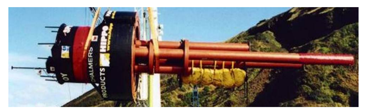
Figure 2. Embley Energy SPERBOY™