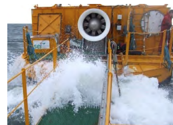
The PBE initiative funds crosscutting research and development to support small marine energy powered systems and to connect end users with technological solutions across the blue economy.

Some smaller research projects need funding to first assess the potential for and merit of future research. For this reason, WPTO started the Seedlings Program , which gives researchers at national laboratories, like the National Renewable Energy Laboratory, Pacific Northwest National Laboratory, and Sandia National Laboratories, an opportunity to test innovative ideas using short-term projects that have the potential to grow into long-term endeavors. Already, several national laboratories have capitalized on this program to explore novel ideas in ocean observation, aquaculture, microgrids, seawater mineral extraction, and small-scale energy harvesting devices.