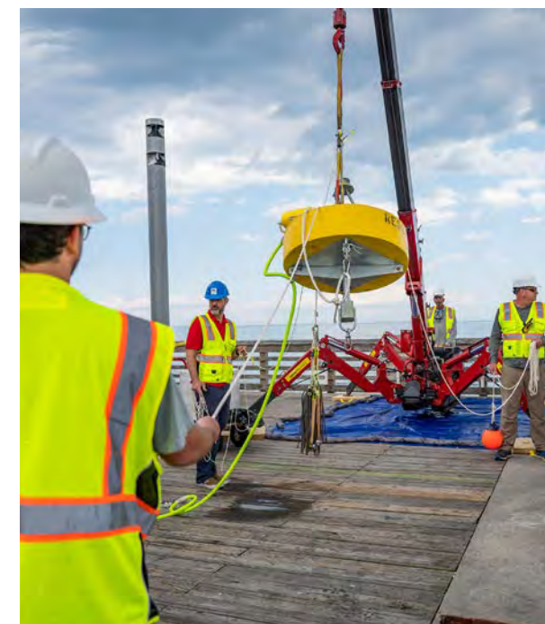
Team members deploy a preliminary testing device that supports foundational research for small, modular, wave-powered desalination systems at Jennette's Pier in Dare County, North Carolina.