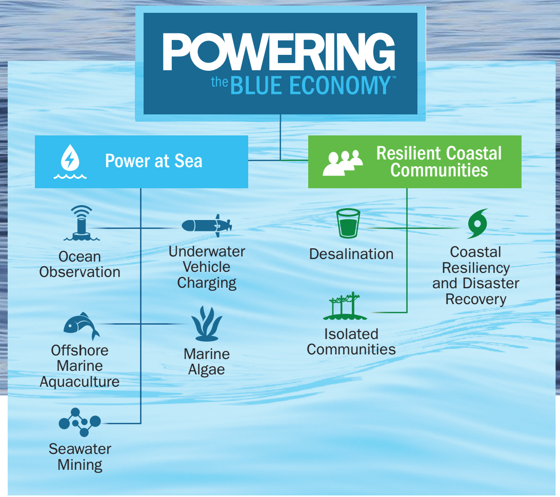
Top photo: Powering the Blue Economy initiative aims to explore how to sustainably use ocean resources to support the ocean's life and livelihood, and in turn, how the ocean can support our lives and livelihood.

As this economy grows, we need to build a sustainable system to preserve and regenerate the health of ocean ecosystems.