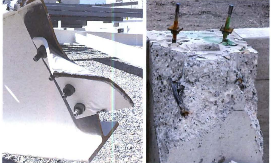
Figure 3: Examples of damage to OSE2 and adjacent building