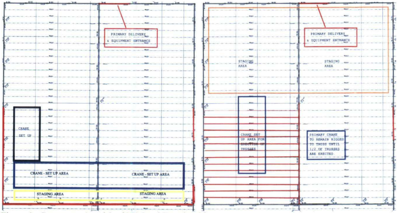
Figure 1: Sequences 1 and 2 of IEI Steel Erection Plan

The partial structure collapsed on June 17, 2012 at 5:15 PM during a period of high winds. Based on data collected about 400 yards from OSE2, the sustained wind speed during this period was over 40 miles per hour with gusts over 60 miles per hour. Wind speeds of this magnitude are expected at NRF and are bounded by the specification requirement of 96 miles per hour. Figure 2 shows the partially-erect OSE2 structure before and after the collapse.