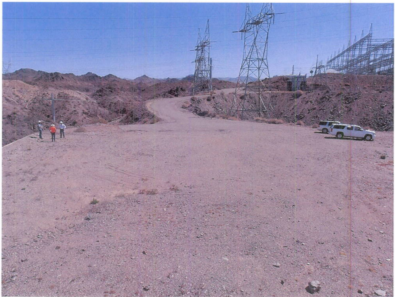
DAVIS MAINTENANCE BUILDING - SITE -