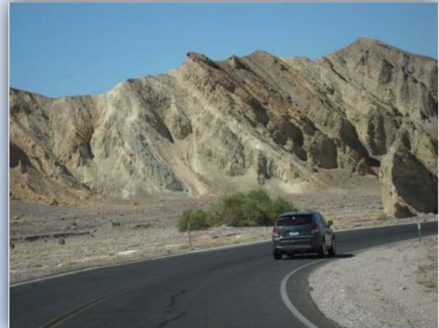
Death Valley, California

This presentation does not contain any proprietary, confidential, or otherwise restricted information