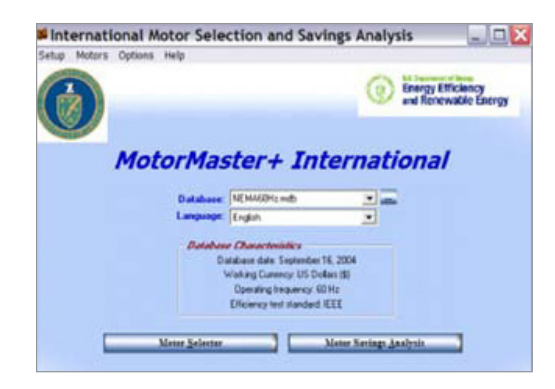
Figure 1: MotorMaster+ International offers multi-language capability. Currently, it supports Spanish, French, and English.

MotorMaster+ International has multi-language capability (with the current release supporting Spanish, French, and English) and allows users to conduct economic analyses using various currencies. The software also allows users to insert applicable country or regional motor full-load minimum efficiency standards and country-specific motor repair and installation cost defaults.