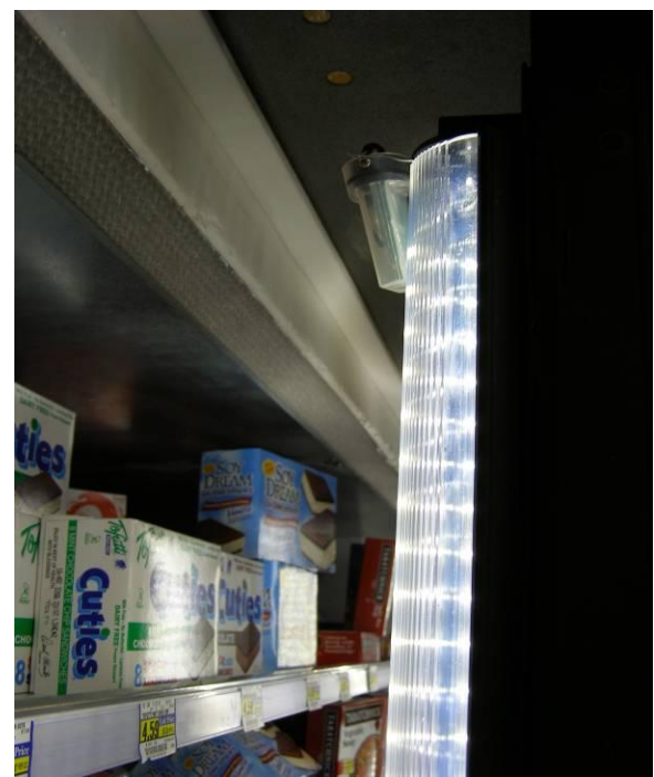
Figure 6. Hobo Light Level Logger installed at top of new LED light strip.

The loggers used were Hobo model UA-002-64. A total of six units were installed inside the cases and remained for a period of approximately two weeks after the retrofit. The resolution of the loggers was set to a reading level of every 20 seconds to capture energy savings as accurately as possible while allowing for the longest test period possible. In this case, the 20 second setting allowed approximately 2 weeks of recorded data from January 19 to February 3, 2009.