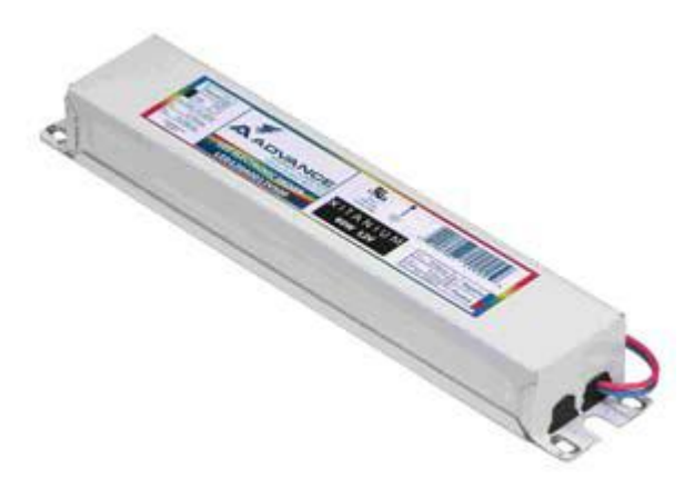
Figure 2. Advance LED driver LED120A0024V33F