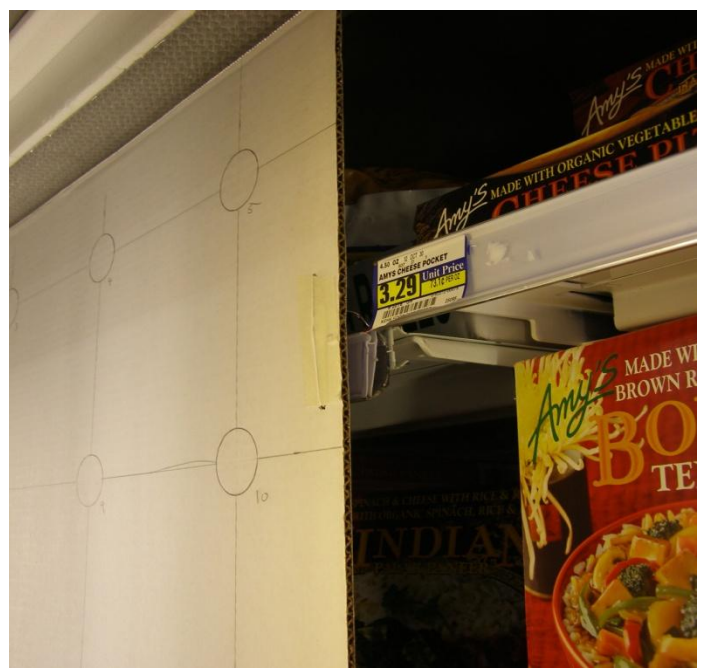
Figure 5. White test card inside of case with measurement locations