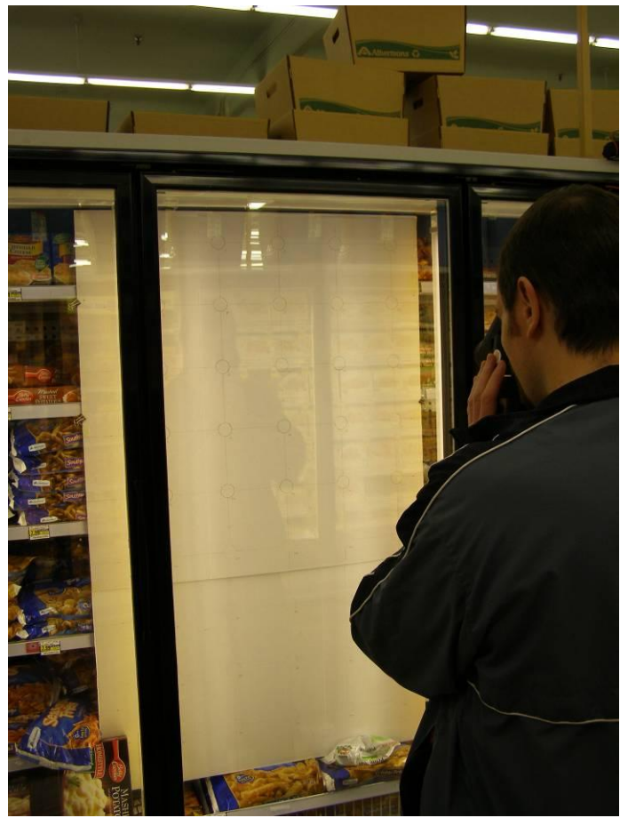
Figure 4. Luminance measurement of white test surface inside of case