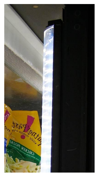
Figure 1. Top of LED Power LED strip as installed