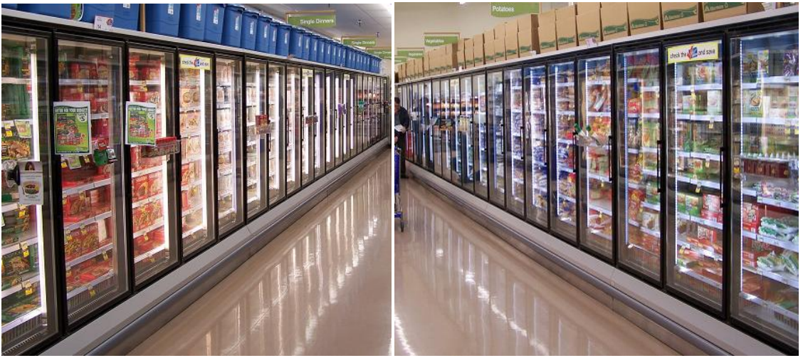
Figure 7. Side-by-Side Fluorescent (left) to LED (Right) Comparison

The potential for more uniform distribution of lighting is a potential capability with LED luminaire design and application. This was evaluated in this application and the LED system was found to be just slightly less uniform then the fluorescent. However, in the case of product cases where widely varying package graphics and colors are the norm, the limited personal observation from this study shows little noticeable difference in case product viewing due to this uniformity issue alone.