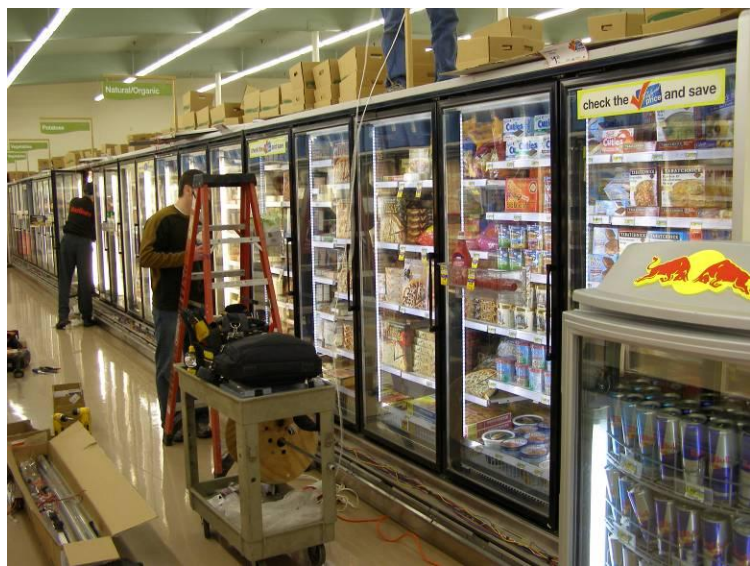
Figure 3. LED strip installation starting at one end of row

After the LED installation was complete, the Aztec crew proceeded to install the occupancy sensors located on top of and centered for each of the 5-door and 3-door cases. The sensor units installed were an LED Power Developed Occupancy Sensor Control System that works in conjunction with a WattStopper model FS-705. Functional testing of the occupancy sensor operation and spot checks of the case luminaire luminance at the full and occupancy sensor reduced levels was also completed.